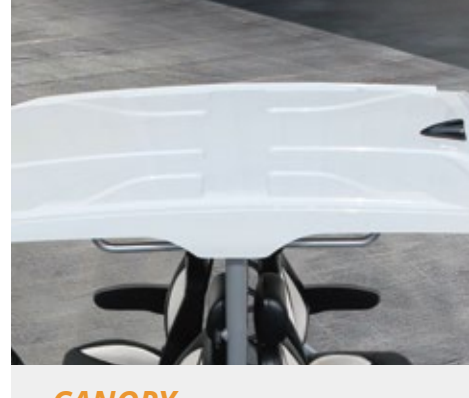
CANOPY Provides protection against the sun and rain. Its color is consistent with the vehicle body.

The accelerator is on the right. The brake is on the left.