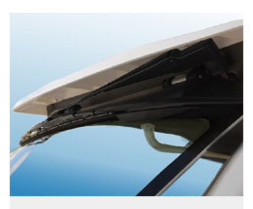
STANDARD WIPERS Ensure you have a clean, clear view of the road ahead at all times.