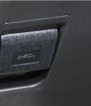
TRUNK UNLOCK LATCH

Pull the trunk unlock latch under the steering wheel (dashboard) to access the compartment.