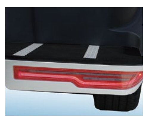
TAIL LIGHTS Tail lights include LED brake lights and LED turning signals.