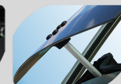
Tiltable Laminated Windshield