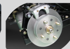
Four Wheel Disc Brake